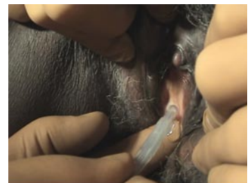
Figure 5. Guiding the Catheter.