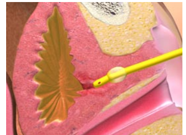
Figure 4. Partially Inflated Balloon in Urethra.