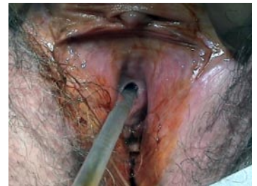
Figure 2. Advancing the Catheter.